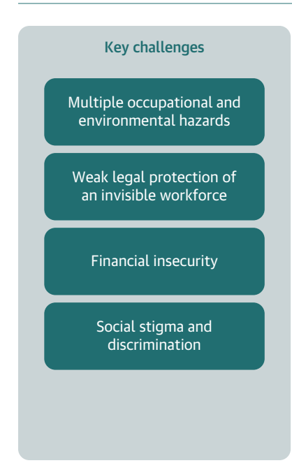
FIGURE ES.1. Key Challenges, Identified Good Practices, and Areas for Action

Sanitation workers range from permanent public or private employees with health benefits, pensions,